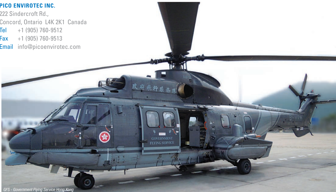
GFS - Government Flying Service Hong Kong