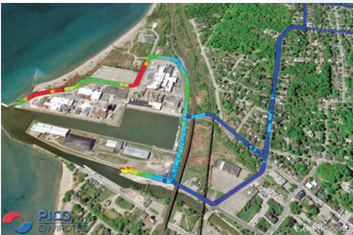
Post mission data plot superimposed on satellite image