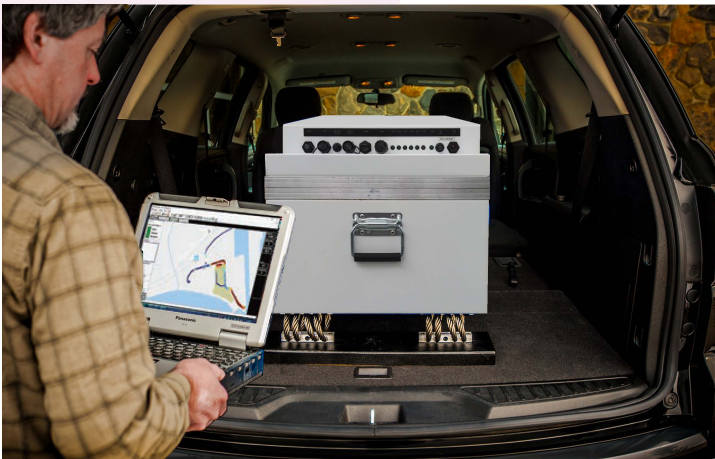
Typical vehicle deployment showing real time data plotting on map

Surveillance observation results are ready for visualization on a map and reporting, right after a mission.